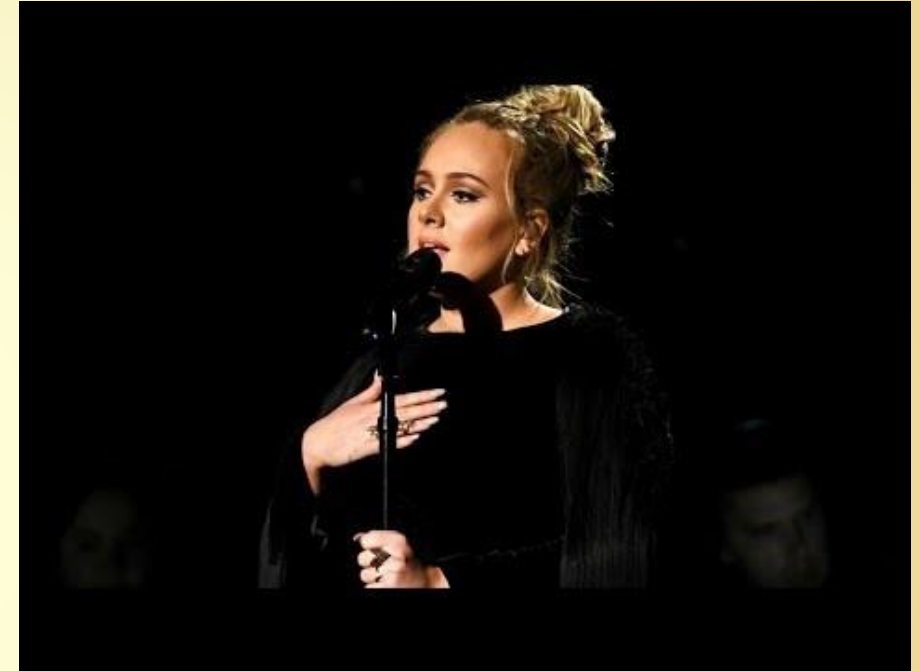
Adele Cancels Remainder of Tour Reveals She 'Damaged' Vocal Cords

The understanding of vocology is important in the field of Vocal Performing Arts! Artists like Adele, Keith Urban, Frank Ocean, Alicia Keys and Justin Timberlake have suffered from vocal injuries.