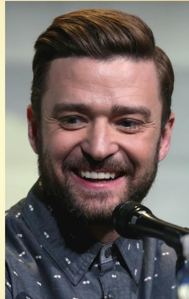
Justin Timberlake had vocal nodules.