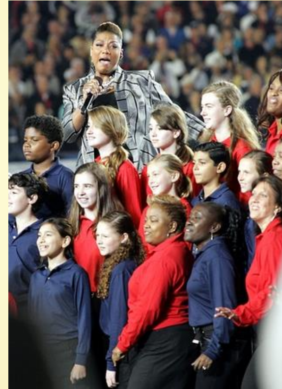
Queen Latifah Sings God Bless America Prior To Kickoff For Super Bowl XLIV In Miami.

Slide presentation, video, poster, infographic