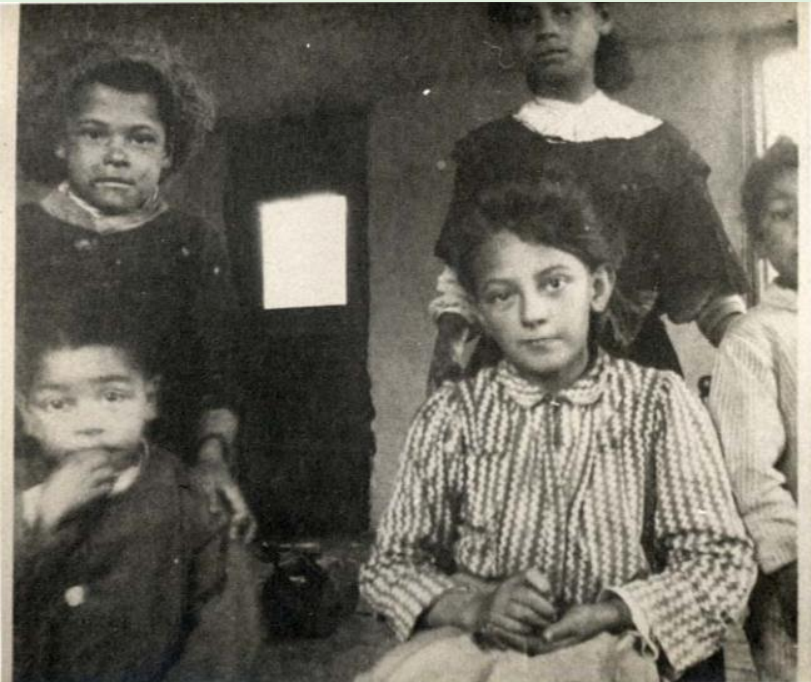
Children in a home on Malaga Island, circa 1920