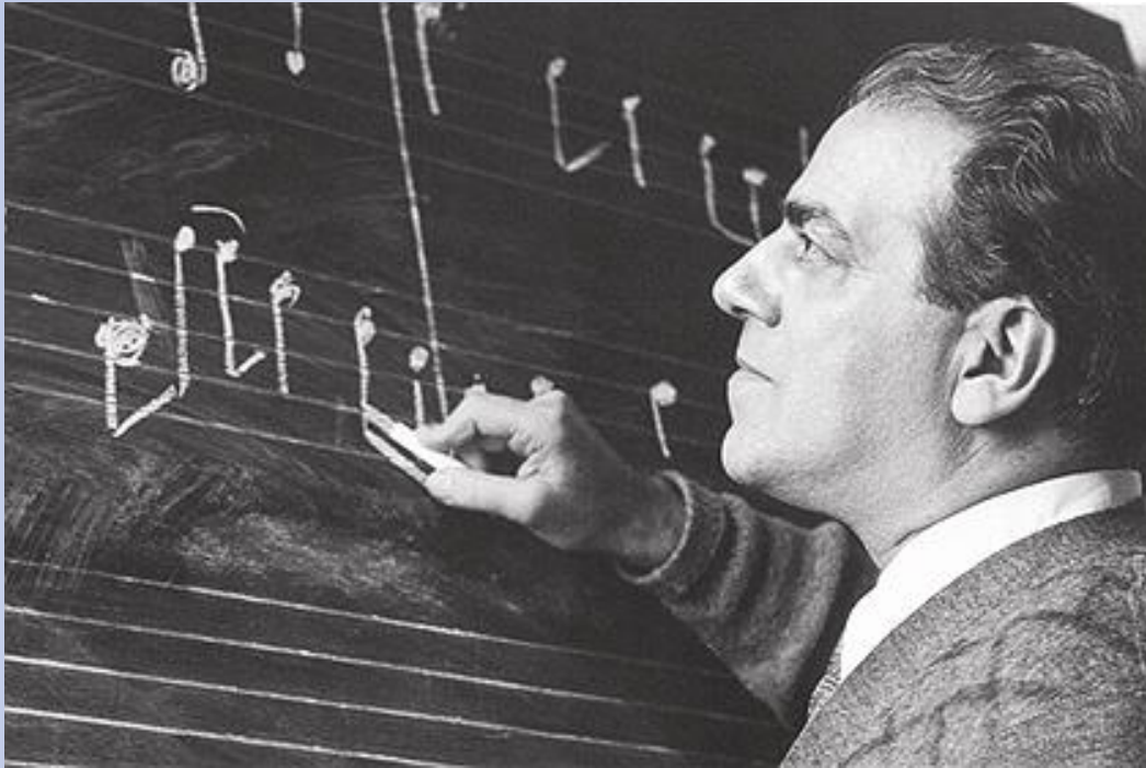
Heitor Villa-Lobos teaches a singing class.