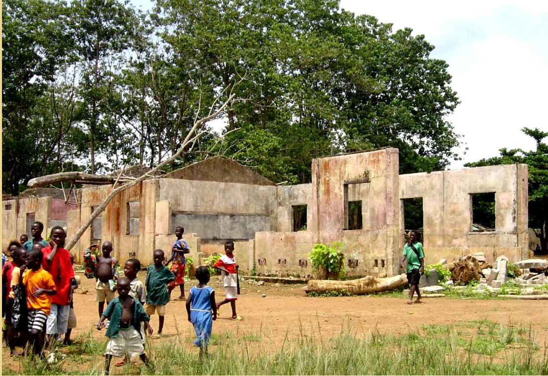
School destroyed by Sierra Leone Civil War.