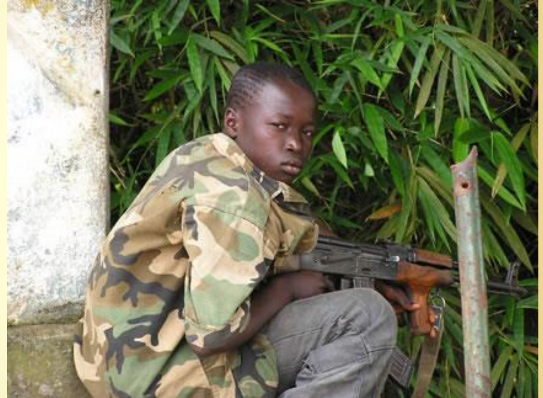
A child soldier in Liberia hides behind a bush with a gun in his hands.

Follow this rubric to ensure you have included every element. Alternatively, your teacher may choose to use the PARCC rubric.