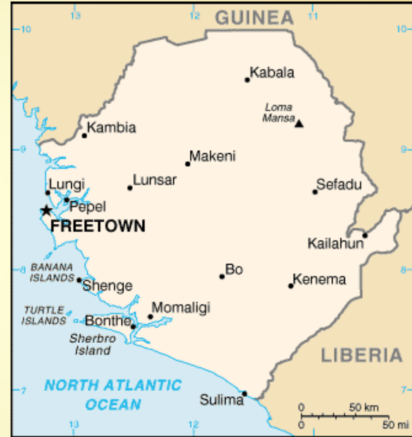
Map of Sierra Leone.